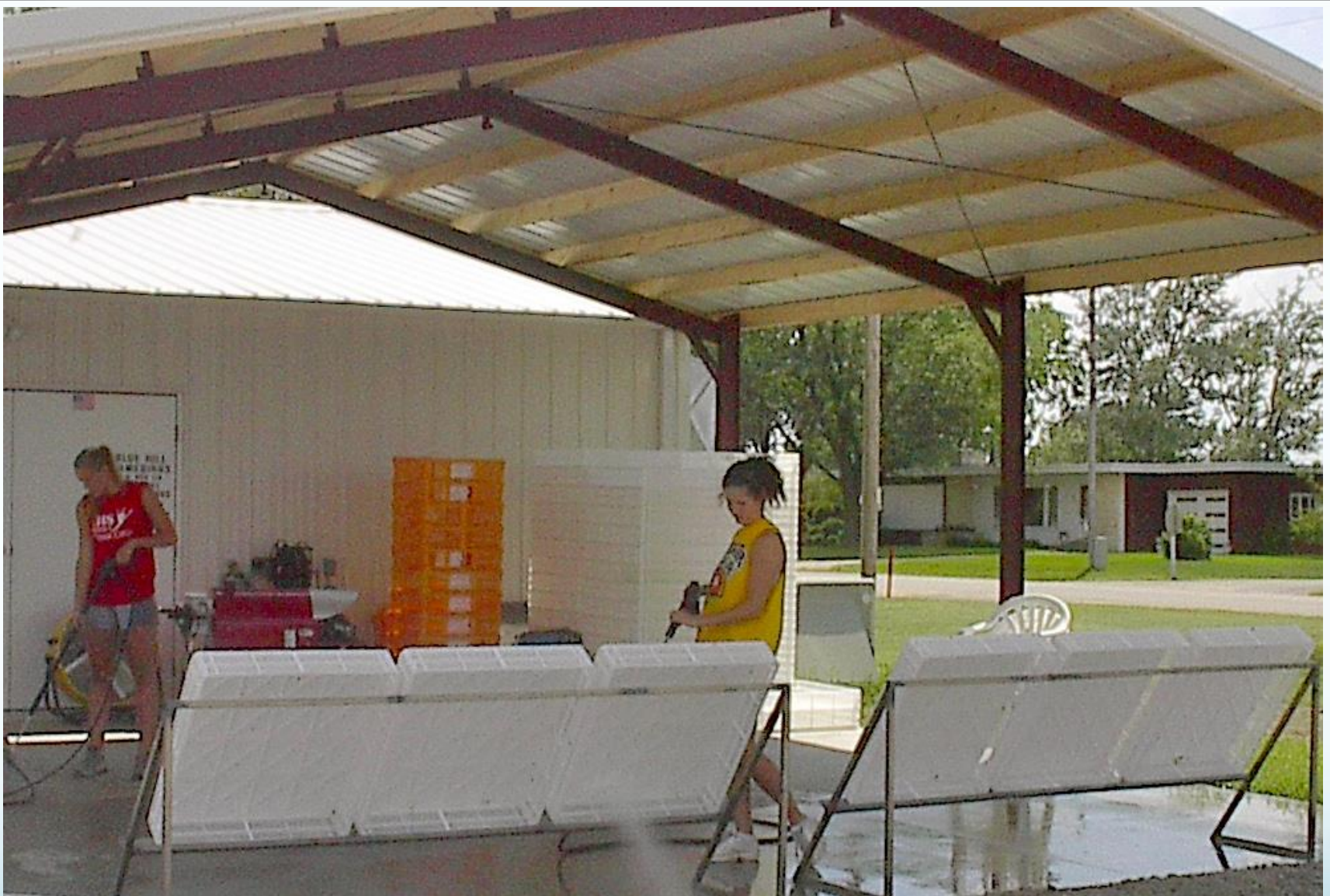
POWER WASHING THE HATCHING BASKETS